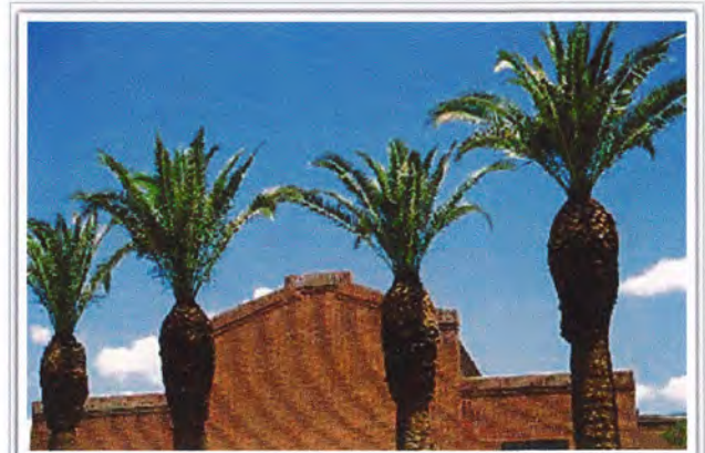
Severely overpruned palms

Video: How to Prune a Cabbage Palm--Lee County Extension on YouTube ( http://www.youtube.com/watch?v=cAL19Dz11rl )